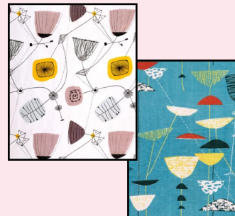
Lucienne Day prints