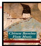
Chinese classical flute music