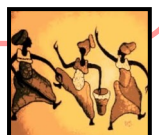
African Nursery Rhymes

TRAVEL Musical focus: Performance Learn a Tanzanian game song and accompany a travelling song using voices and instruments. Listen to an orchestral piece and improvise own descriptive.